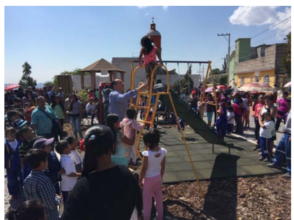
mexico-Opening of playground/park