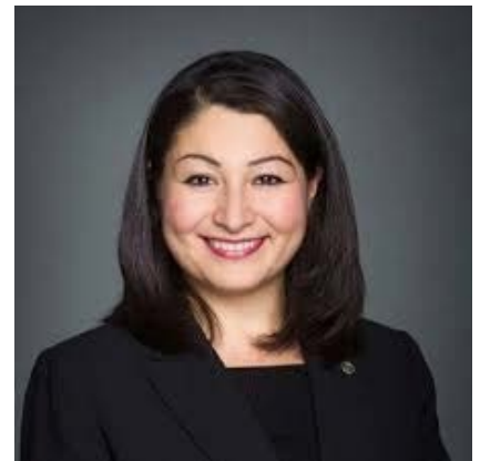
Minister Maryam Monsef

Carolyn Bennett, Minister of Crown – Indigenous Relations. “The Government of Canada is proud to work with you to advance the needs of Métis women from coast to coast to coast. We know that when women are seen and heard, they use their voices to the benefit of their families and entire communities.”