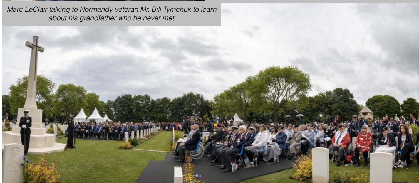
Commemorative Ceremony at the Canadian War Cemetery Bretteville-l'Orgueilleuse-sur-Laize on June 7