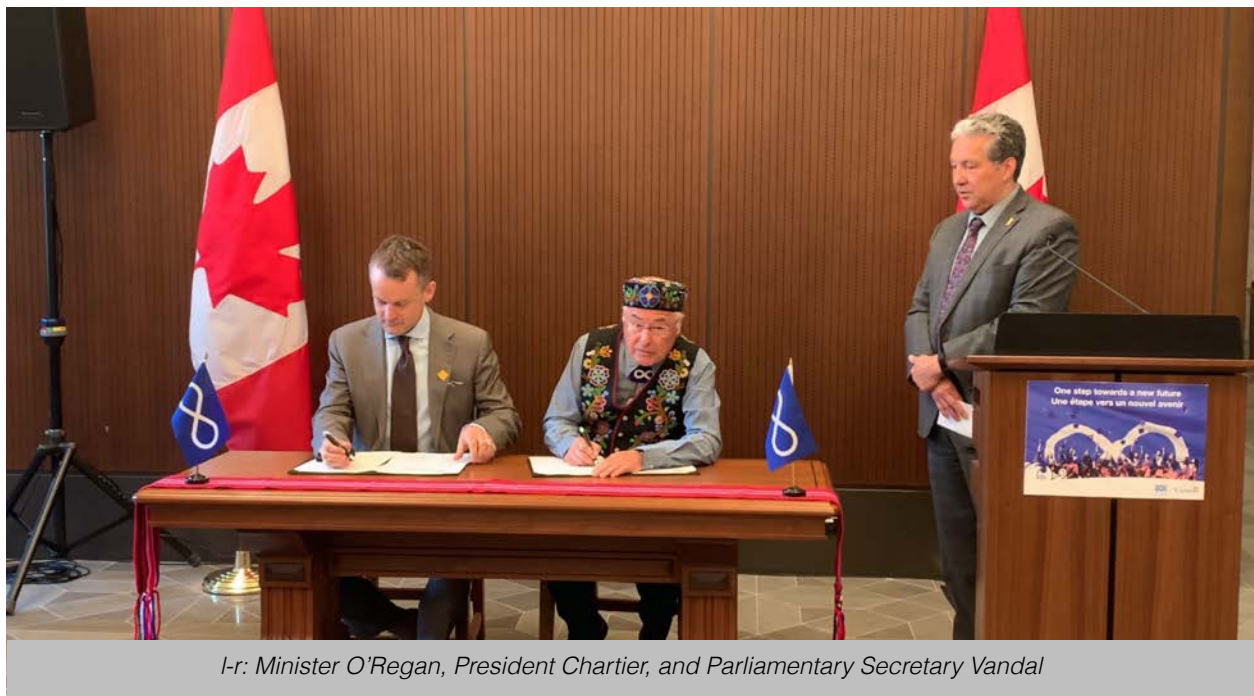
l-r: Minister O'Regan, President Chartier, and Parliamentary Secretary Vandal

On June 10, 2019, Ottawa, ON: The Minister of Indigenous Services, Seamus O'Regan, and the President of the Métis National Council, Clément Chartier, signed a historic agreement that signals the Government of Canada's commitment to providing post-secondary education supports